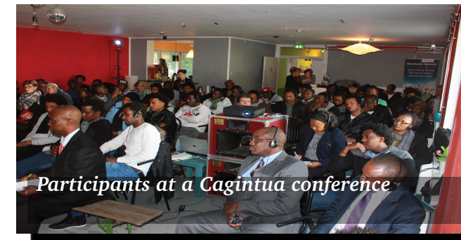
Participants at a Cagintua conference

A new Africa where we will never flee again!!!